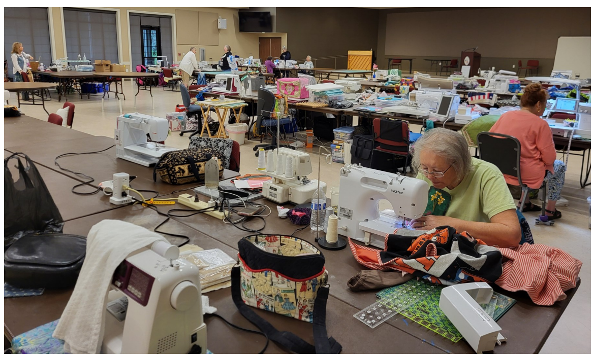
The retreat at the Day Springs Retreat in East Parish was a resounding success. Those attending enjoyed the Show & Tell and meeting other attendees.